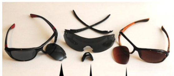
Magnet lens (Switch Vision)

We compared three systems for their quality, ease of interchange, and overall usefulness.